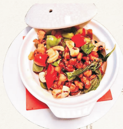
SAN BEI CHICKEN