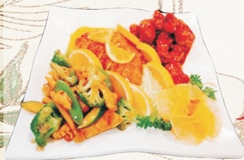
THREE' S COMPANY