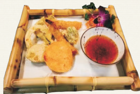
SHRIMP & VEGETABLE TEMPURA