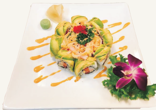
FU JI YAMA ROLL