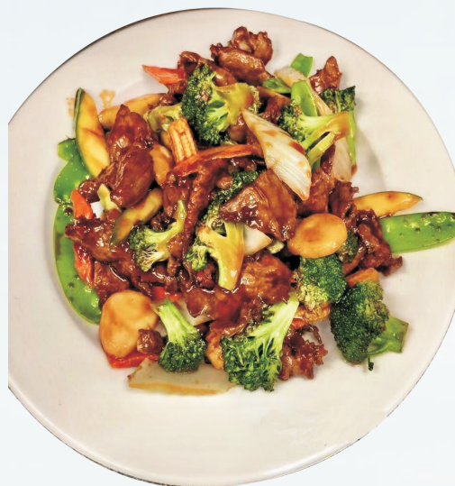
BEEF WITH MIXED VEGETABLES