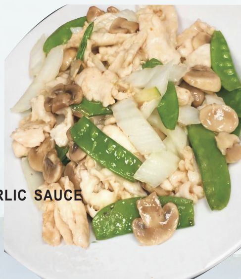
MOO GOO GAI PAN