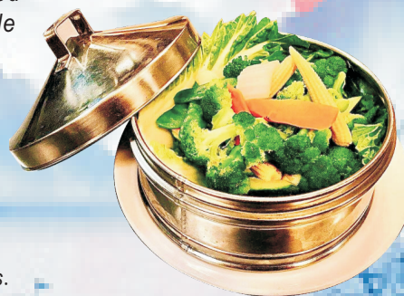
LEAN CUISINE VEGETABLE DELIGHT