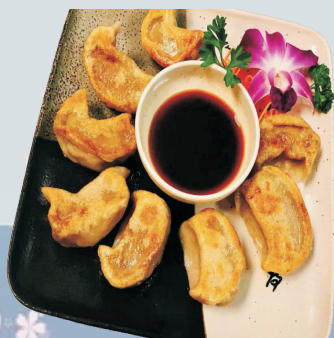
FRIED MEAT DUMPLINGS