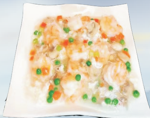
SHRIMP WITH LOBSTER SAUCE