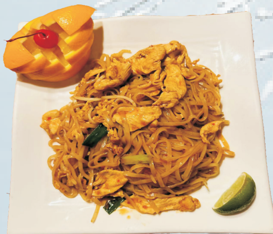
CHICKEN PAD THAI