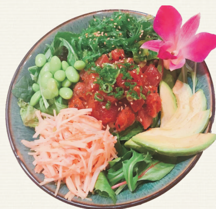
TUNA POKE BOWL