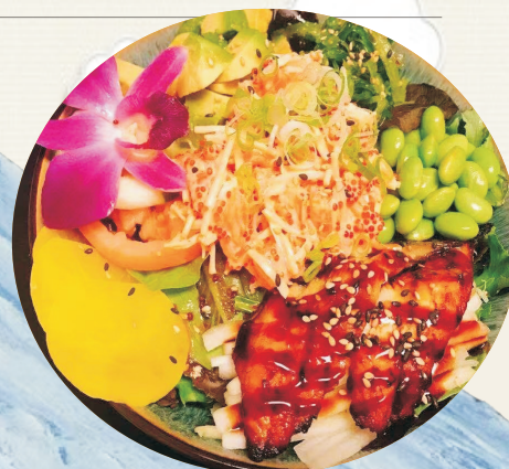
LILY POKE SALAD