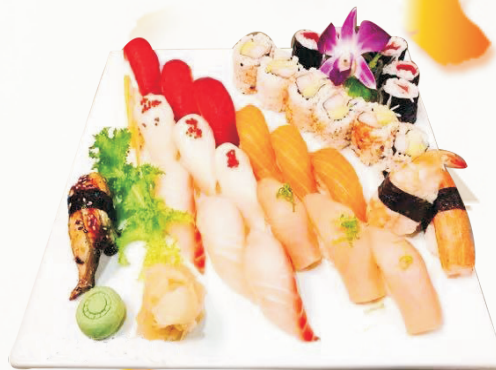
ST' S SUSHI SPECIAL