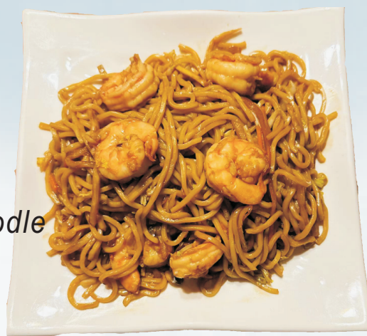
SHRIMP LO MEIN